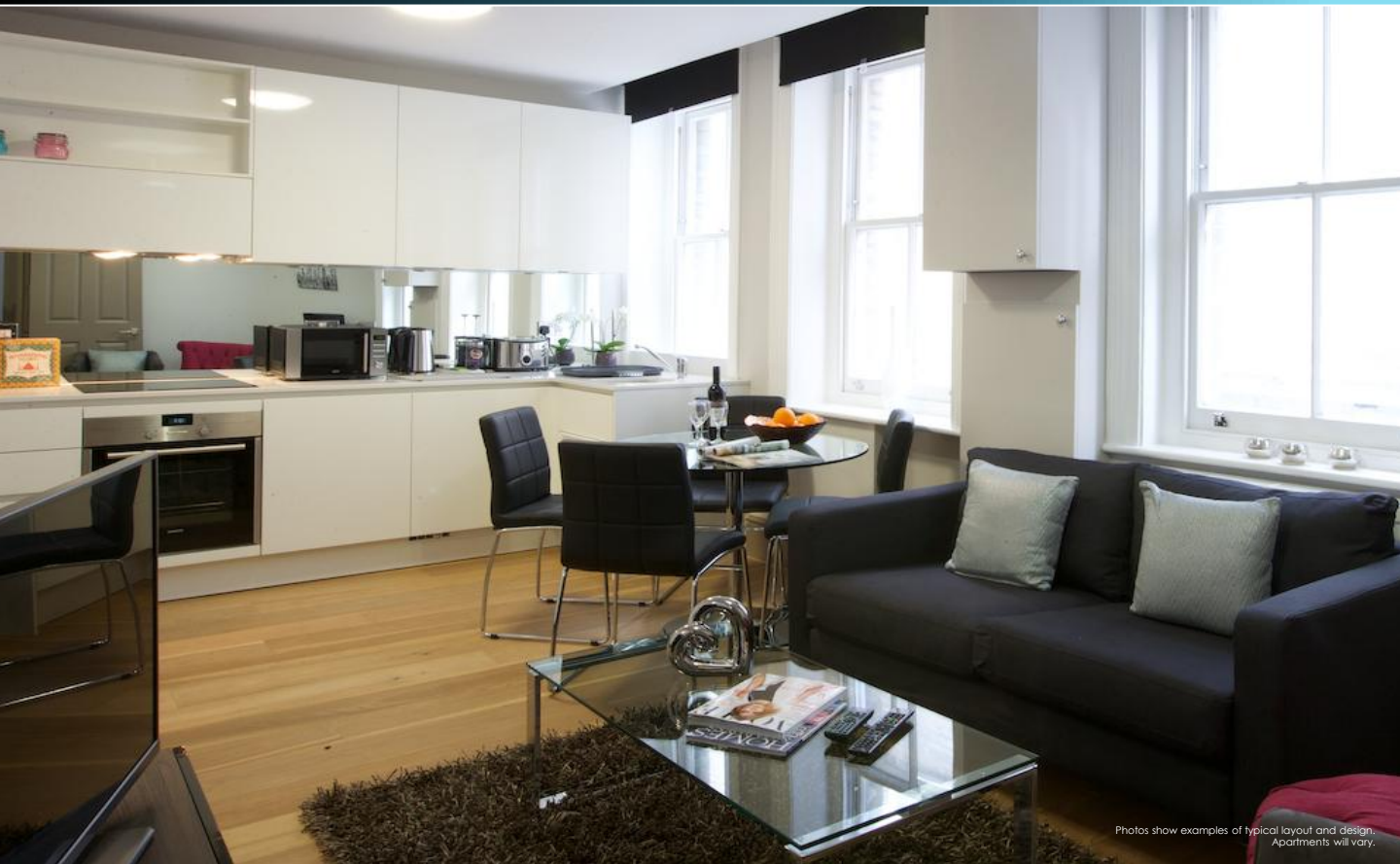
Photos show examples of typical layout and design. Apartments will vary.