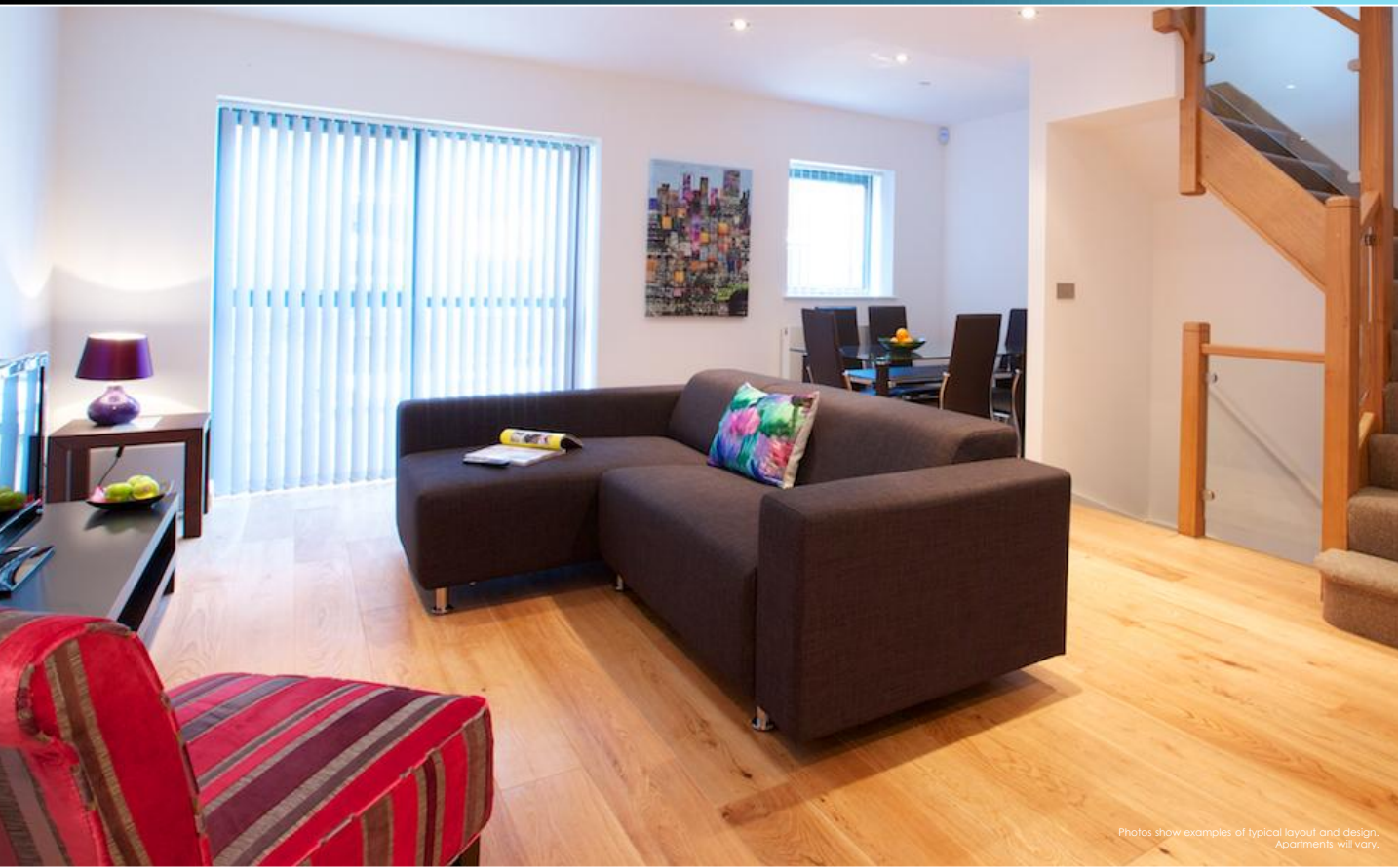
Photos show examples of typical layout and design. Apartments will vary.